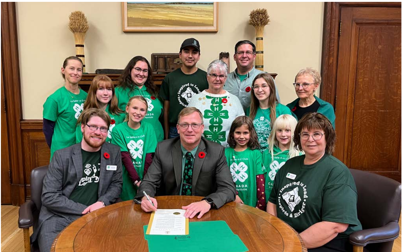
Proclamation presentation 2022