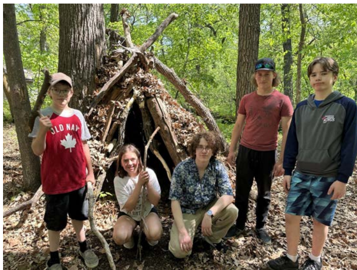
4-Hers learn shelter building skills at the Intermediate Members' Event at Camp Manitou in May 2023.

Special thanks to our event supporters, Canadian Agricultural Partnership, Manitoba Agriculture, SeCan and Access Credit Union.