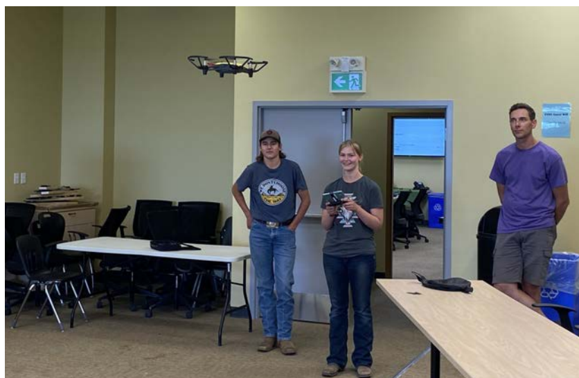
4-H members learn to fly a drone during a Drones in Agriculture workshop in Portage la Prairie in July 2023.

Our application included Career Days at our 4-H booth at the Royal Manitoba Winter Fair, Drones in Agriculture, Virtual Vet Series, Event Workshops, Leader Learns/Appreciation Days and Agri Career Quest. Each of these educational series was well received by all participants.