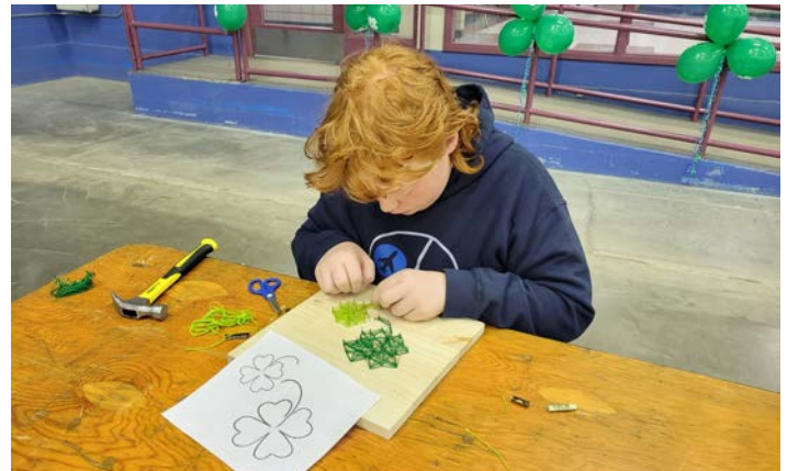
A 4-H member creates string art during the Arts workshop at the 4-H Manitoba Rally in Brandon in May 2023.

Workshops included Archery, Dog Training, Roping, Goat Tying, Arts, Foods, Science, Equine and Beef. 4-H members enjoyed a presentation of Indigenous Drummers and Dancers. All clubs marched in the parade and some excitement to end was the Tug-of-War.