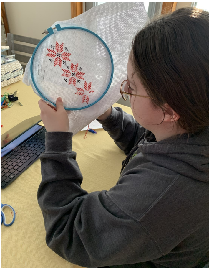
A participant in the Cultural Crafts virtual series works on a cross stitch project in March 2023.