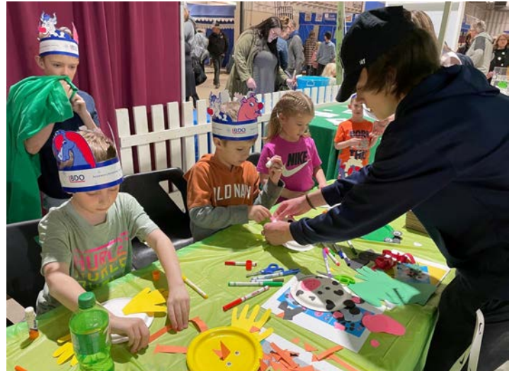
Children visit the 4-H Manitoba booth on 4-H Day at the 2023 Royal Manitoba Winter Fair in Brandon to do some crafts with 4-H members who volunteered to assist at the event.