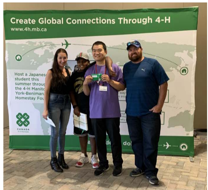
Above: A 4-H Manitoba host family and their Homestay student attend the Sayonara Party at Kelburn Farm south of Winnipeg on August 11, 2023.