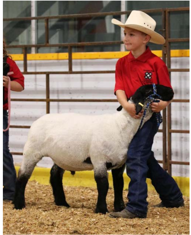
Above: A member of the Mountain View 4-H Club prepares to show his sheep at the Dauphin & District 4-H Beef and Sheep Show & Sale in June 2023.