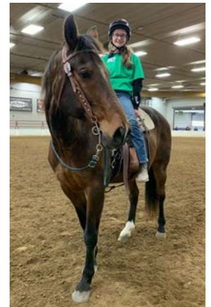
Right: One of the participants in the Equine clinic at the May 2023 4-H Manitoba Rally poses for a photo atop her horse.