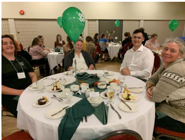
Left: Participants in the October 2022 Provincial Conference and Senior Members' Event enjoy the banquet at Brandon's Keystone Centre.