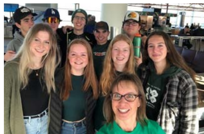
4-H Manitoba members and their chaperone get ready to depart for 4-H Canada Members Forum in Toronto in November 2022.