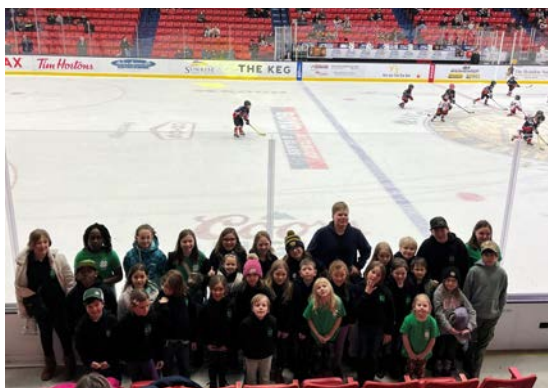
Brandon Explorer's 4-H Club members attend the Brandon Wheat Kings hockey game on March 4, 2023 at Westoba Place.

The Manitoba Moose has also invited our 4-H Manitoba families to attend one of their games in the past few years. This year our members were provided with a sponsored free ticket to attend the November 6, 2022, game.