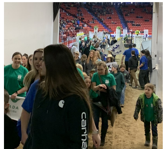
4-H Manitoba members and leaders leave the main arena after opening ceremonies at the Royal Manitoba Winter Fair on 4-H Day.