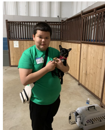
Left: A 4-H member gets ready for the Dog Training workshop.