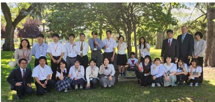
Left: The Japanese delegation visits the Manitoba Legislature and Honourable Derek Johnson, Agriculture Minister, on July 27, 2023.