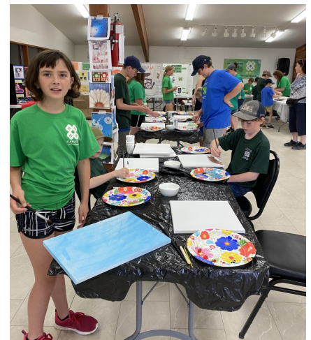
From left: Poplar Hill 4-H Club members participate in Brandon's Santa Claus parade in November 2022; A member of the Foxwarren-Solsgirth 4-H Beef Club brushes her calf during the Foxwarren-Solsgirth Fat Stock Show in June 2023; Members of Goodlands Variety, Boissevain Home & Hobby and Souris Challengers 4-H clubs get creative at a Canvas Painting workshop at the Boissevain & Area Rally in June 2023.