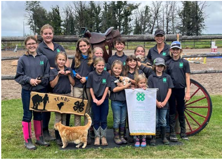
Members of the Tenby 4-H Equestrian & Stockman's Club are all smiles at their reorganizational meeting in fall 2022.