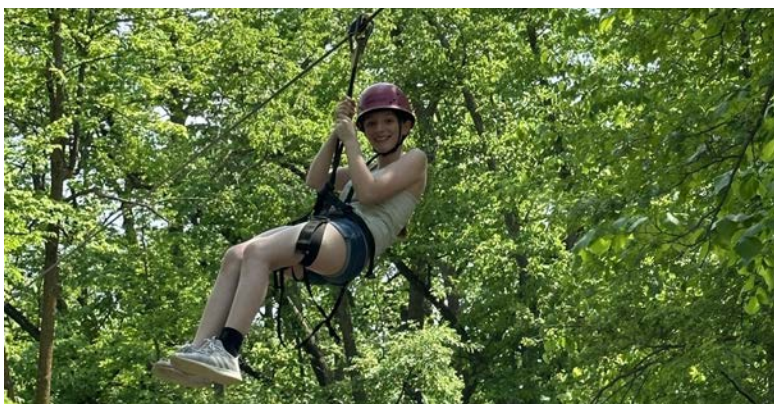
Above: A participant in Intermediate Members' Event takes a ride on a zipline at Camp Manitou. Right: Two Intermediate members try out the Climbing Wall during the May 2023 event.