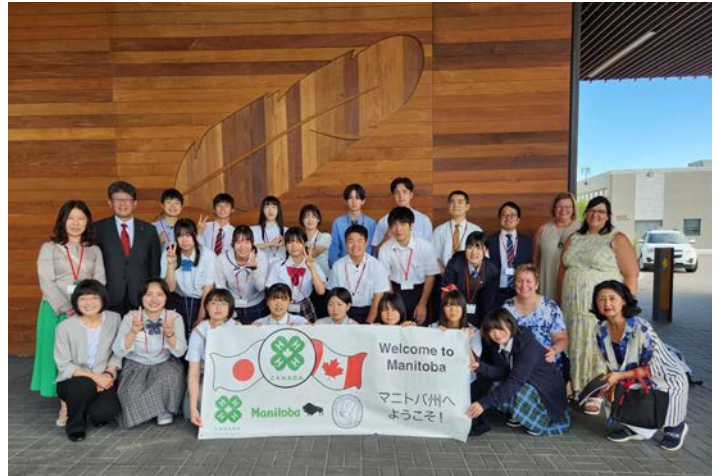
The YBF Japan Homestay delegation of 20 students and two chaperones mark their arrival in Winnipeg on July 26, 2023.

The many benefits of the 4-H program are highlighted through media opportunities which showcase the host family experiences and high-profile events.