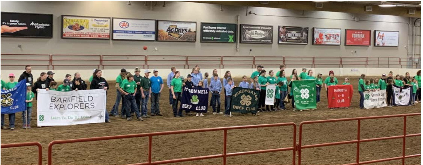
4-H clubs take part in the parade to kick off the 4-H Manitoba Rally at the Westoba Agricultural Centre of Excellence in Brandon's Keystone Centre in May 2023.