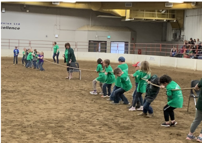
4-Hers participate in the Tug-of-War at the Westoba Agricultural Centre of Excellence in Brandon to wrap up the 4-H Manitoba Rally on May 13, 2023.