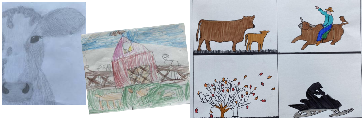
A variety of “visual letters” created by 4-H Manitoba members.

This year, 26 4-H Manitoba members from 7 clubs submitted creations for the art exchange, which helps participants gain a sense of being part of one world.