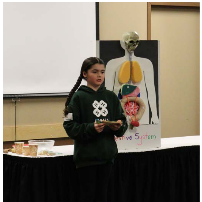
A 4-H Manitoba member makes a presentation during the Provincial Communications Extravaganza in Brandon in April 2023. SeCan funds support the annual event.

The fundraising opportunity during the 4-H year actually began October 10-17, 2022 when producers across the two provinces were required to book certain varieties of SeCan soybean seed for the 2023 growing season. Following this booking period SeCan paid provincial 4-H programs $1 for every unit of soybean seed reserved within their province during this campaign that ended up being sown in 2023. A significant portion of these funds is directed to clubs and Area Councils in Manitoba that were in close proximity to the location of the sales. In total, five Area Councils and 42 4-H clubs benefitted from these funds, generated by the sales at seven participating SeCan soybean seed retailers around the province. These funds are used to support a great variety of 4-H activities and initiatives, including sponsorship of provincial-level programming. Manitoba 4-H Council and our members and leaders who benefit from the 2022-23 Grow a Leader funding are grateful to SeCan, their supporting retailers and the farmers who purchased these varieties under the banner of the campaign.