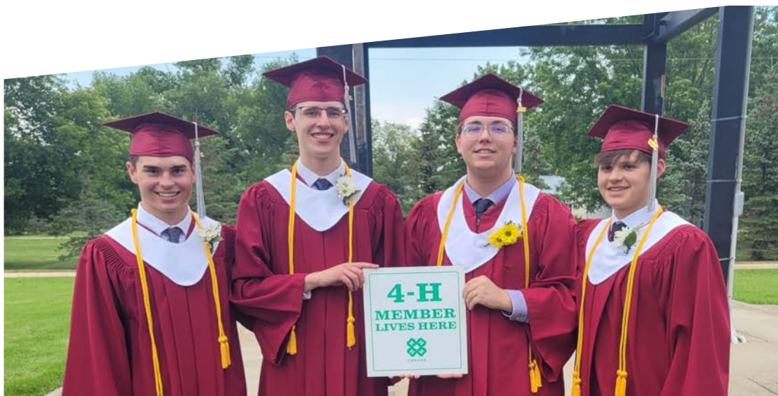
Four members of the Headingley 4-H Club celebrate their high school graduation in June 2023.

4-H: A vibrant program blending tradition and innovation for a quality experience.