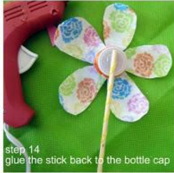
step 14 glue the stick back to the bottle cap