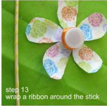
step 13 wrap a ribbon around the stick