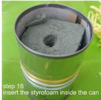
step 16 insert the styrofoam inside the can