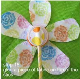
step 15 glue a piece of fabric on top of the stick