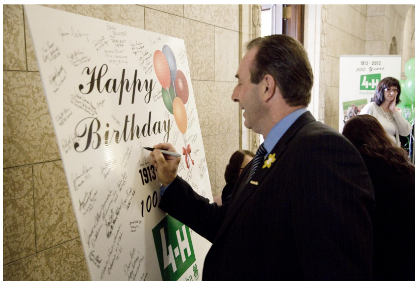
4-H Day at the Legislature, April 25, 2013